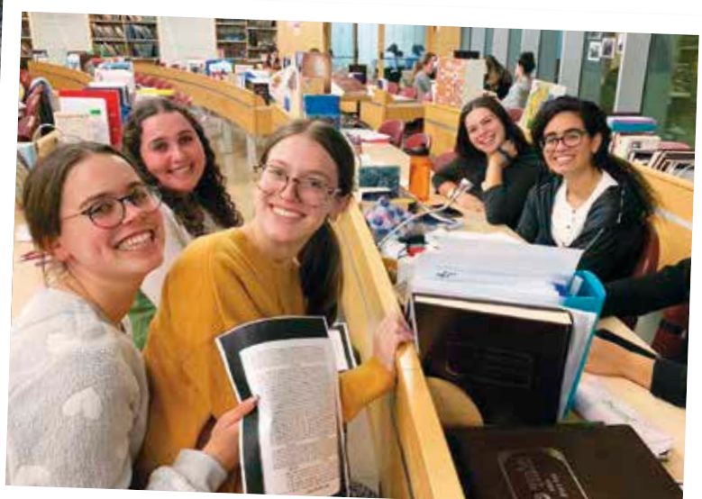
CHAVRUTOT WITH ISRAELI FRIENDS