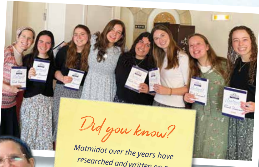
MATMIDOT WITH THEIR PUBLISHED JOURNALS!

Did you know? Matmidot over the years have researched and written on a plethora of topics including: Tehillim, Aggada, Free Will, and How Tragedy Affects Tefilla.