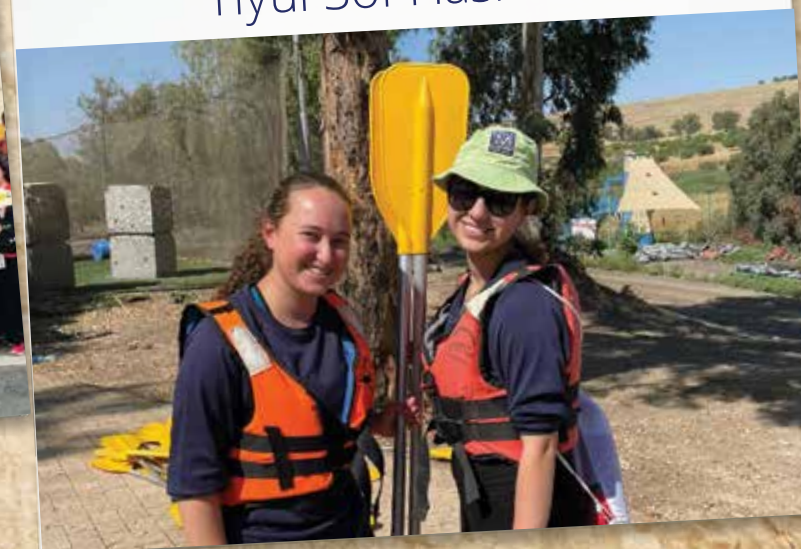
Sivan Tiyul Sof Hashana

Observing the holidays and seasons of the year in Eretz Yisrael is an amazing spiritual experience. Midreshet Lindenbaum provides students with unique opportunities to engage in the communal aspects of being part of Am Yisrael.