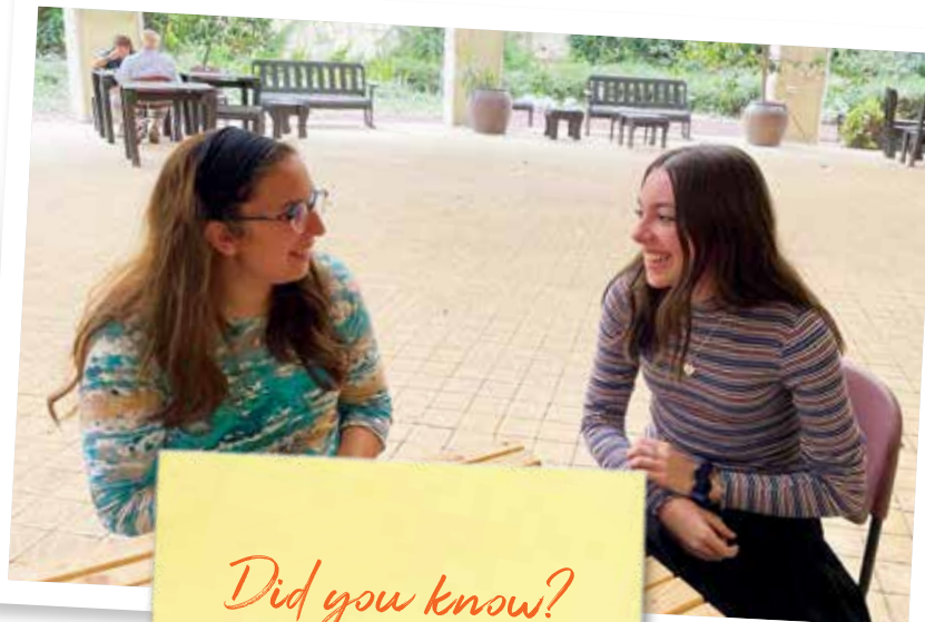
ISP MENTORING MEETING

Our Individual Spiritual Program (ISP) pairs you with a staff mentor for regular meetings to develop an individualized and goal-oriented plan to foster spiritual growth and implement what you learn at your own pace. It's an incredible opportunity to think deeply about where you are, what you are reaching for, and most importantly, to plan practical steps toward achieving your goals in spiritual growth and Torah observance.