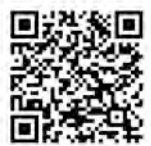
SHABBAT AT RAV BROFSKY'S — ALON SHVUT