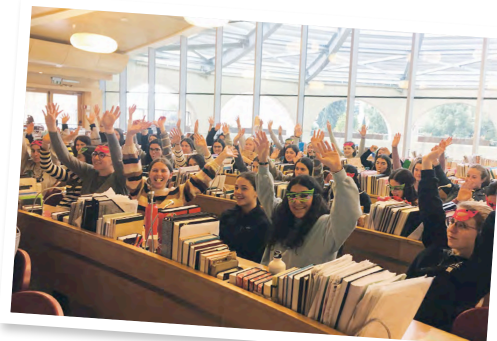
ROSH CHODESH ADAR IN THE BEIT MIDRASH