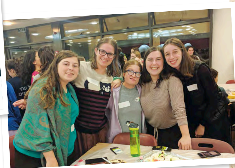
CHANUKIYAH-MAKING WITH DARKAYNU AND ISRAELI FRIENDS