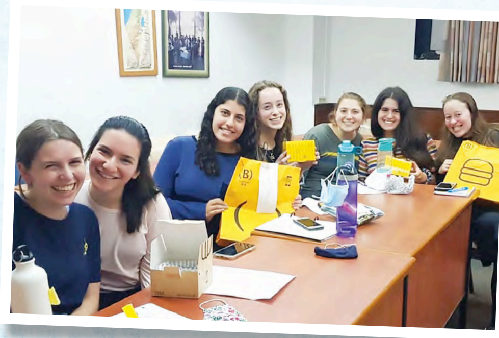
MATMIDOT DINNER OUT

"Lindenbaum's Matmidot program showed me that I not only have the ability to learn Torah at a high level but that I can also be michadesh and contribute to the world of Torah."