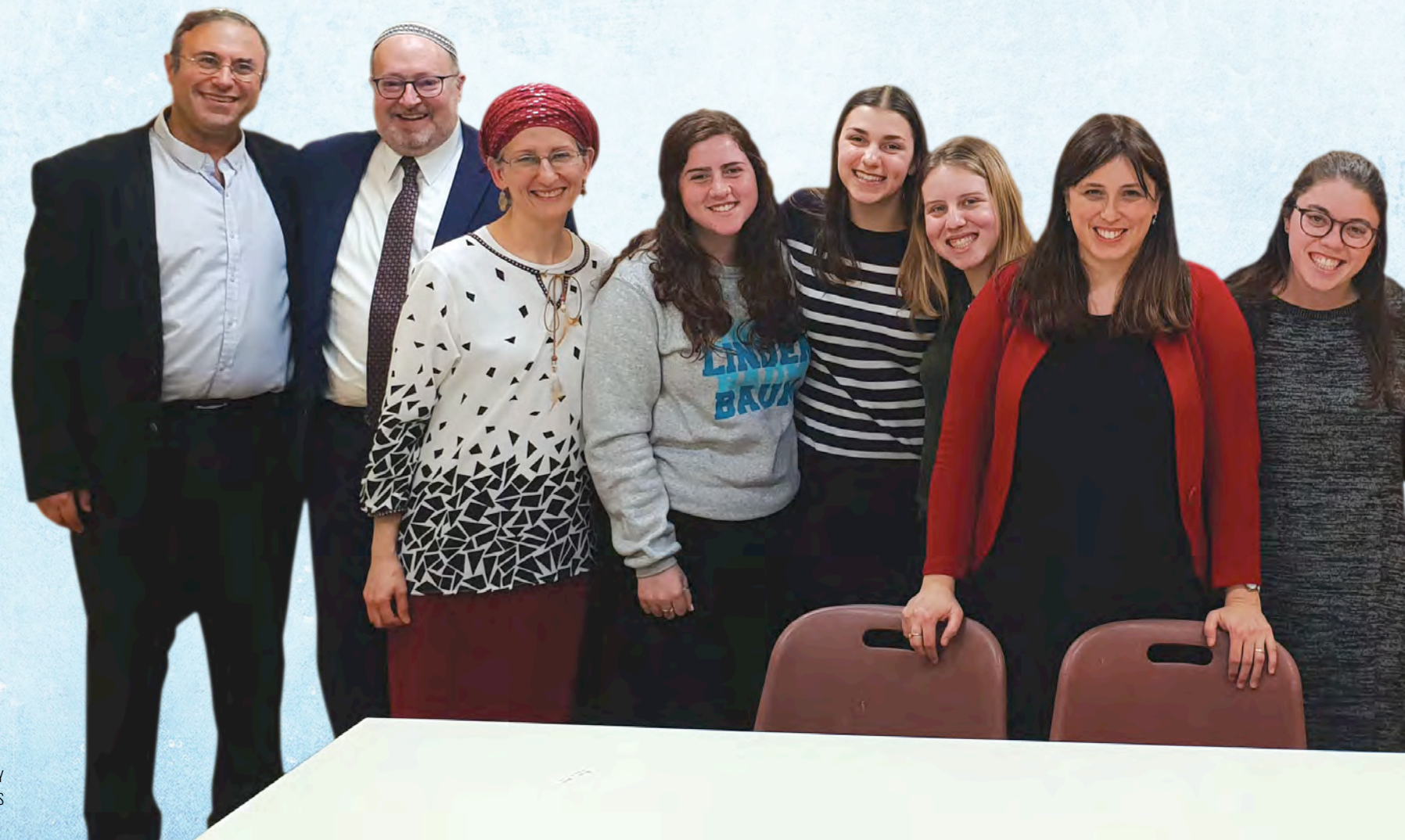
MATMIDOT MEETING WITH KNESSET MEMBER TZIPI HOTOVELY WHEN SHE WAS MINISTER OF DIASPORA AFFAIRS