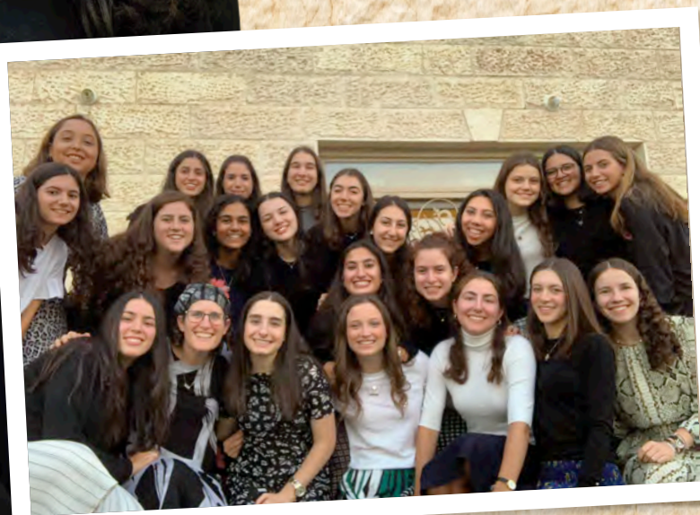
SHABBAT AT RABBANIT DENA'S