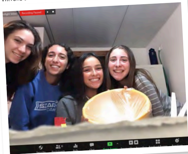
VIRTUAL CHALLAH BAKE DURING QUARANTINE